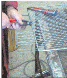
ABOVE and BELOW: C Aiano craftsmen aim for an unobtrusive solution

The recent work that we undertook with Aiano guards at St John the Baptist Church, Bere Regis, Dorset was required due to a spate of vandalism at the church. It is unfortunate that the erection of guards is necessary but the result has been very well received by the church. •