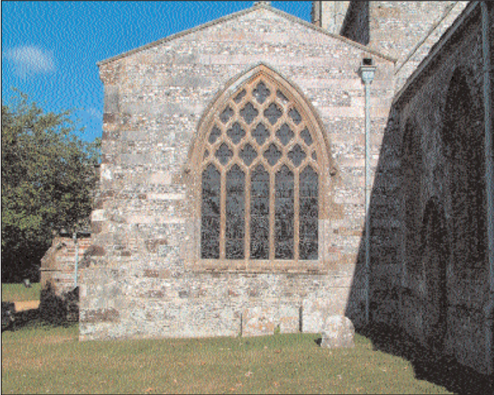
You've got to look pretty closely to realise that guards have been installed

he considered to be rather impertinent. I was pleased to be able to inform him that they had in fact been in place for over a week.