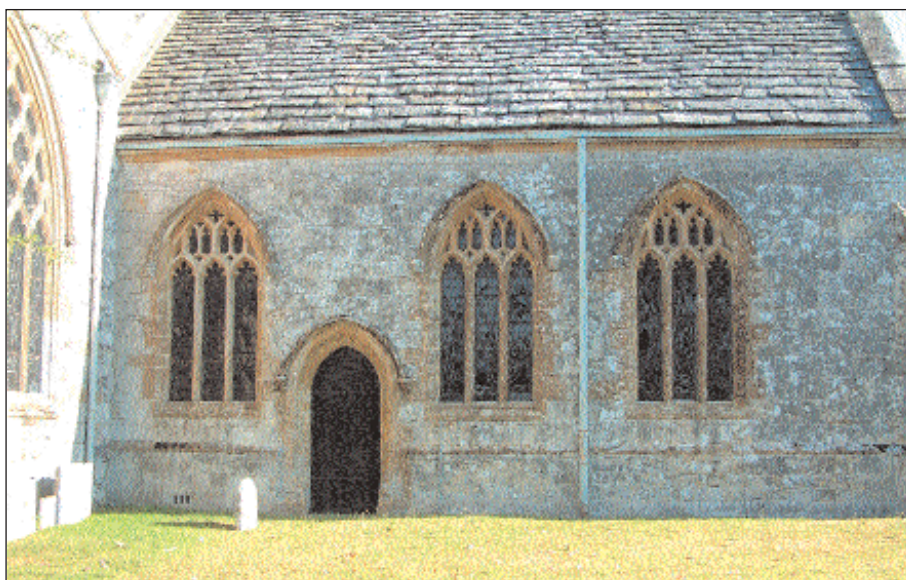
St John the Baptist Church, Bere Regis, Dorset

We have always liked to provide our clients with a choice, so we carry a number of sample pieces of wire guards. Most people will choose the Aiano guard, and this is usually because they find it "not too uniform and modern in appearance", "not flat and uninteresting". This may seem trivial, but when you are fixing guards to the outside of an ancient building (and in many cases to most windows), it is important to have as pleasant and unobtru-